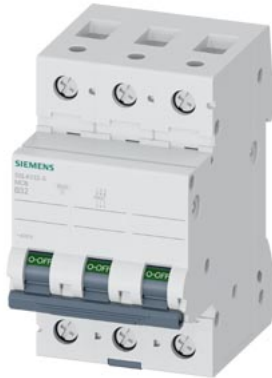
Miniature circuit breaker 400 V 10kA, 3-pole, B, 32 A