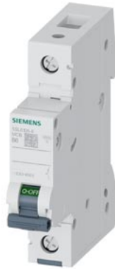
Miniature circuit breaker 230/400 V 6kA, 1-pole, B, 6A