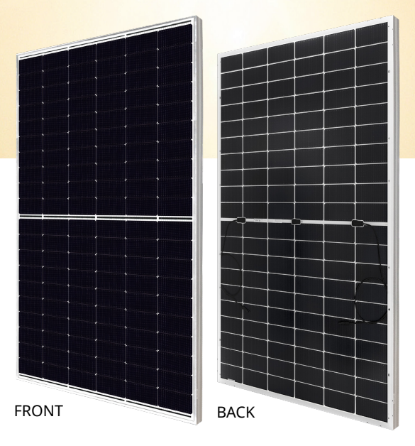
*Black frame product can be provided upon request.

Heavy snow load up to 5400 Pa, wind load up to 2400 Pa*